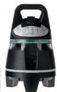
Dräger X-zone® 5000 Front view