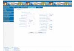
Portables Pro software