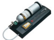
FULL-FUNCTION AUTOMATIC TEST STATION