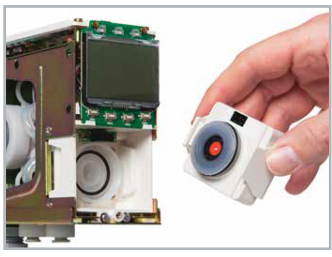
Midas Gas Detector plug-and-play sensor cartridge allows quick and easy sensor replacement