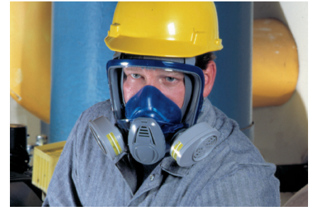
Advantage 3200 with Advantage chemical cartridges

The Advantage filter lines are for use with Advantage 3200, Advantage 200 LS and Advantage 420.