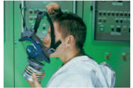
Put your chin into the chin cup