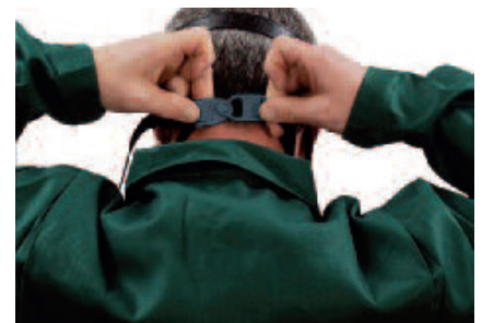
Close neck buckles and pull on both straps evenly