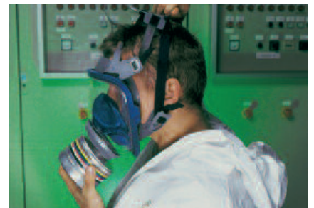
Pull the harness over your head