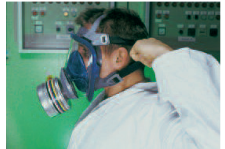
Tighten the two lower straps

The full face mask series Advantage 3000 provides both protection and unparalleled comfort. The soft sealing line made of hypo allergenic silicone provides a pressure-free fit. The large, optically corrected lens ensures a clear, undistorted view, while the grey-blue colour gives the mask an aesthetic appearance.