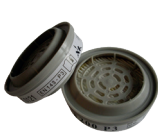
Advantage 200 Particle Filter P3