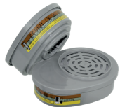
Advantage 201 Chemical Filter A2B2E1