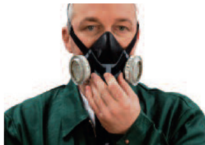
Pull down front straps and lock lever