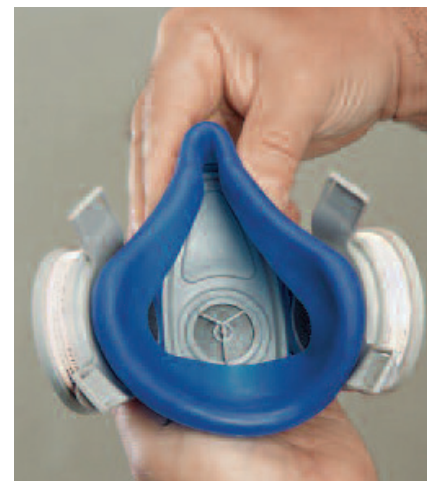
Facepiece-to face Anthrocurve