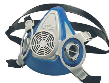
Advantage 200 LS half mask

The Advantage 200 LS is a comfortable, efficient and economic half mask. It is ideal for applications where workers are exposed to various hazards from job to job, such as high concentrations of fumes, mists and gases.