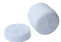
Pre-Filter for Filter Cartridge