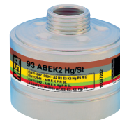
Combination Filter 93 ABEK2-Hg/St