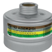
Combination Filter 92 ABEK2