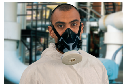
Advantage 410 with P3 PlexTec filter

For detailed information on standard thread filters please see leaflet 05-100.2.