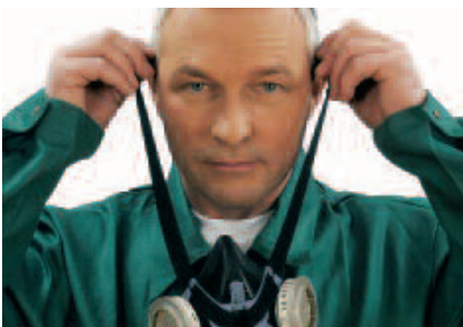
Place cradle on head