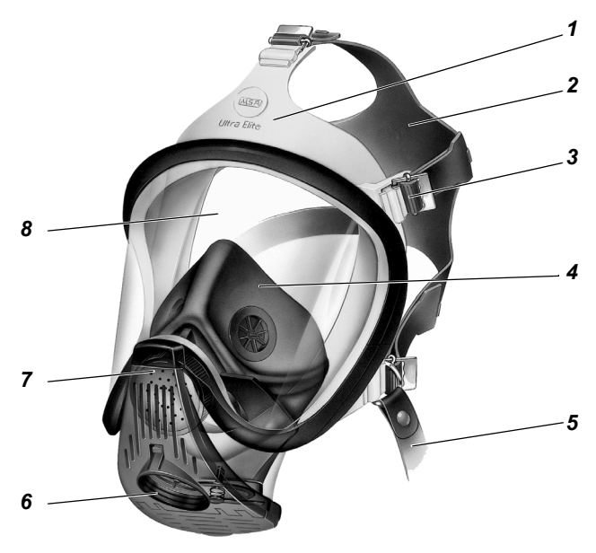
Fig. 1 Overview full face mask

The exhalation air passes through the exhalation valve directly to the ambient air.