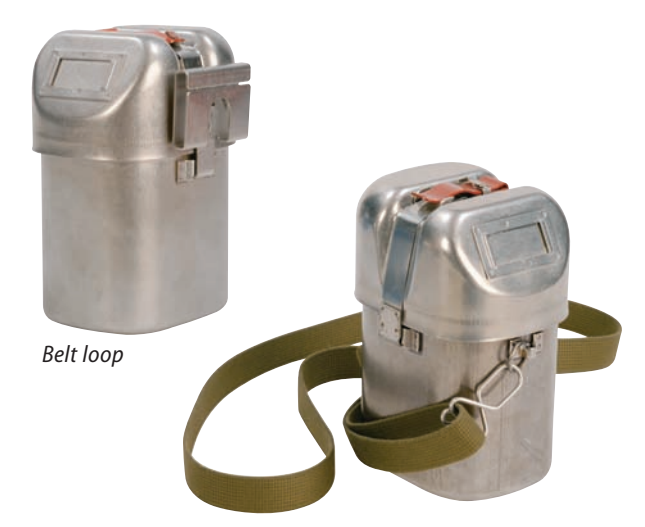
Shoulder carrying mode

The W 95 is a Filter Self-Rescuer designed for extended escape routes, available in shoulder carrying mode (W 95) or with integral belt loop (W 95 BL). The CO-filter uses a noble metal catalyst and a Hopcalite pre-filter. This unique combination provides high breathing comfort together with reduced inhalation resistance and temperature. It has a service life of more than 4 hours.