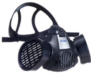
Dräger X-plore® 3000 Series