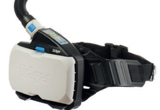
Dräger X-plore® 8000 Series