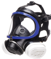
Dräger X-plore® 5500 Series