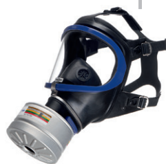
Dräger X-plore® 6000 Series