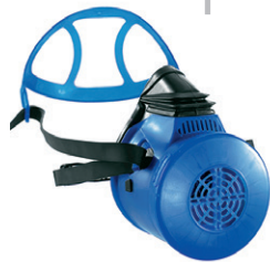
Dräger X-plore® 4700 Series