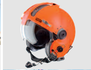
Helmets for forest fire and rescue missions