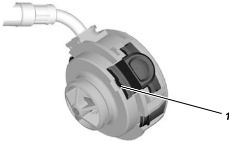
Fig. 3 Housing