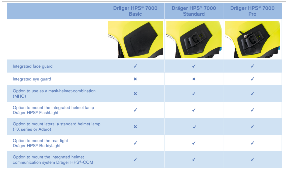
Dräger HPS® 7000 – Side function plates